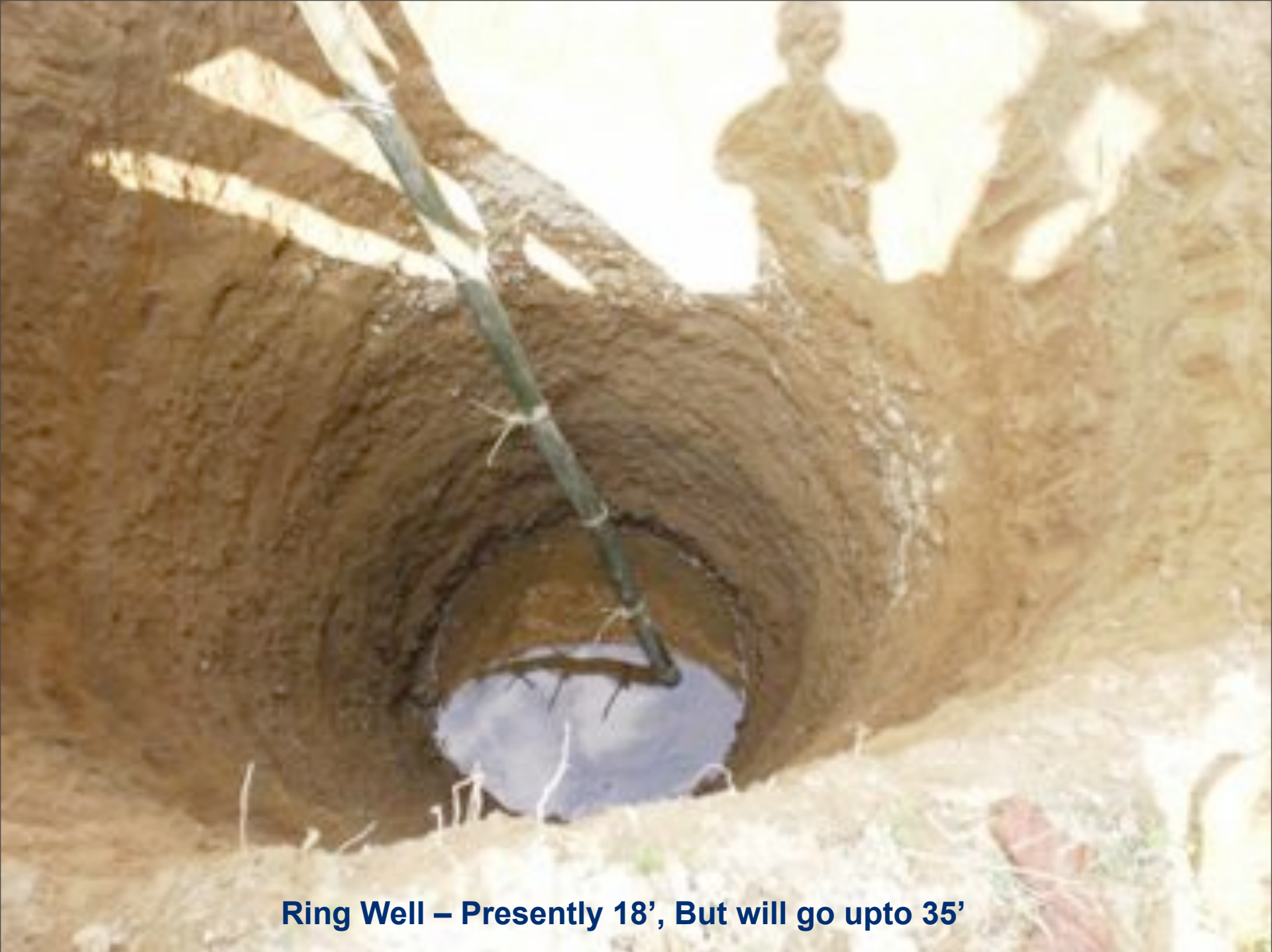
Ring Well – Presently 18', But will go upto 35'